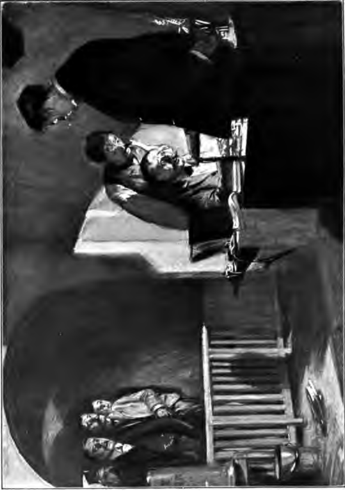
The trial became one of endurance.